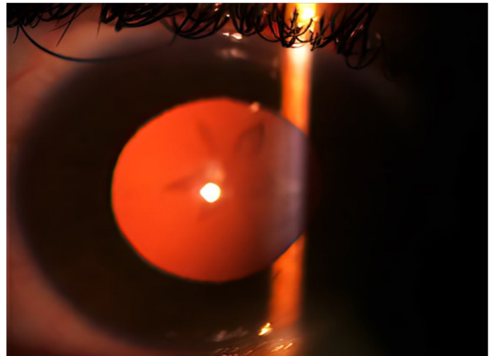
Figure 2: Retro illumination view of the right eye's rosette cataract