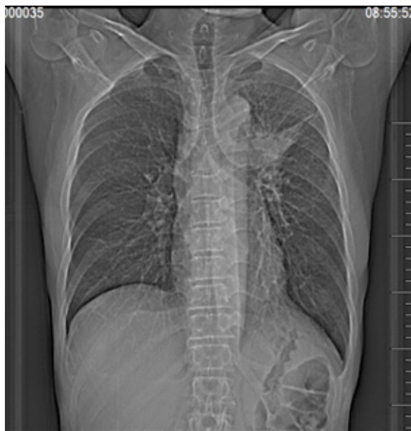
Figure 2: Plain CT scan of the chest showed a 4.3cm×2.6cm mass in the hilar area of the left upper lobe, and bronchial occlusion in the posterior and anterior segments of the left upper lobe.

After the MDT (neurosurgery, thoracic surgery, oncology, endocrinology) of the expert group, chemotherapy was started on January 18, 2023. The chemotherapy regimen was carboplatin AUC 5 d1 + pemetrexed 500 mg/m 2 d1 Q21d+ bevacizumab 15mg/kg d1 Q21d. After 2 cycles of chemotherapy, the symptoms of dry mouth and thirst were better than before, and the condition was stable by imaging examination. A large amount of pleural effusion was found during the third cycle of chemotherapy, and imaging examination again suggested multiple bone metastases. The modified chemotherapy regimen was (cisplatin 80mg/m 2 d1 Q21d+ Carrilizumab 200mg d1+ bevacizumab 7.5mg/kg d1 Q21d+ albumin-binding paclitaxel 100 mg/m 2 d1 Q8d) antivasular combined chemotherapy. Pleural catheter drainage and injection of recombinant human endostatin 45mg intrathoracic lavage solution were performed. At the fourth cycle, imaging examination showed no significant changes in the lesions of the patient, but the patient's basic condition was poor at present. The treatment regimen was adjusted again as (antirotinib 12mg/time, once/day + tirelizumab 200mg d1+ albumin-binding paclitaxel 100 mg/m 2 d1 Q8d).